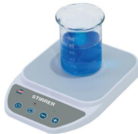
Figure 1. Magnetic Stirrer

Magnetic Stirrer is tool the stirrer that uses magnetic field for move the steering bar that is placed in fluid solution so that will help mix solution in a way homogeneous . The steering bar rotates in a way constant and stable . Principle magnetic stirrer work, namely with utilise A magnetic field or A electromagnetic coupled statistics with motor rotation, the magnet move a steering bar is placed in glass breaker for stir A solution. Speed round from the steering bar you can arranged with arrange speed turn the motor (Asha et al., 2017; Made Agus Mahardiananta et al., 2022). Meanwhile hotplate or heating is tool laboratory used For heat solution sample will researched . The hotplate consists on the top plate that works as a heating pad . During the heating process , the glass breaker contains solution will placed above the top plate. Aluminum chosen as material main top plate because its nature as sender good heat . Hotplate is also equipped with regulator temperature , so in its use temperature can customized with need .