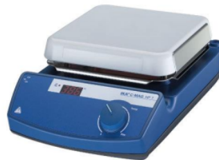
Figure 2. Hot plate

Component The important thing in a magnetic stirrer is a DC motor. DC motors are changing device energy DC electricity becomes power motion . In its application , a DC motor is connected with DC source and generate speed defined play with rotary units per minute (Rpm). Voltage rating , speed rotation , large torque, requirements powerful and big nominal current is a parameter that is taken into account in DC motor selection . Whereas component The main thing on the hot plate is element heater / heater. Heater is A changing elements current