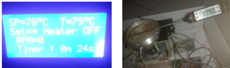
Figure 6. Measurement results Magnetic Stirrer Hotplate temperature

Furthermore, in testing the temperature attainment of the set temperature, the results of the thermocouple sensor readings displayed on the LCD are compared with the results of temperature measurements using a comparison tool. Apart from that, it is also monitored how long it takes for the temperature of the tool to match the set temperature. The initial temperature before heating is set at 31 °C -33 °C.