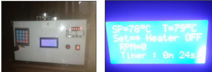
Figure 5. Magnetic Stirrer Hotplate Design Results

Made magnetic stirrer hotplate tool dimensions from tool This is 50cm x 40cm x23cm. Control speed turn and temperature made separated so that tool This can functioned just the stirrer For stir solution , or hotplate only For heat solution , or functioned in a way simultaneously that is heating and stirring solution at a time . When the power button is pressed, all circuits receive voltage, so that the sensor is ready and ready to operate. Then select the temperature, speed and timer settings by pressing the keypad button for the heater temperature, the timer button on the relay for the motor, while setting the motor speed using potentiometer rotation. Once finished, press enter, the heater indicator lights up and indicates that the AC heater is working. When the heater is working, the incoming heat will be detected via the MAX6675 temperature sensor . The results of this processing are processed via a microcontroller, then the LCD displays the plate temperature and rpm. After the temperature is reached, the motor is regulated manually by the timer relay and the speed is regulated by the dimmer .