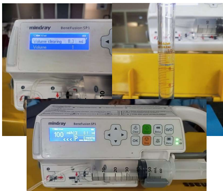
Figure 3. Tool testing

flow or flow rate (ml/h) and stability test or occlusion test (psi). Measurements can be done in two ways, namely using an IDA (infusion device analyzer) or manually using a measuring cup and stopwatch. In this measurement the author used a manual method using a measuring cup and stopwatch.